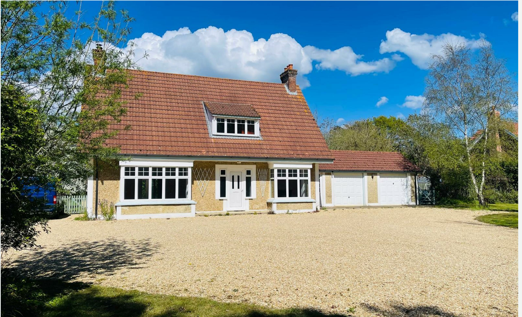
Eversleigh Ningwood Hill, Cranmore, Yarmouth, Isle of Wight, PO41 0XW